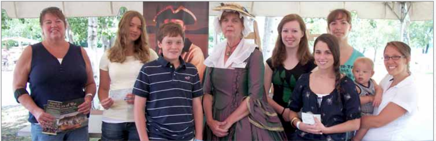
Student essay contest winners and their teachers, Living History Day