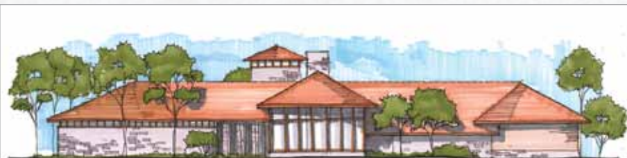
INTERPRETIVE CENTER BATTLEFIELD ELEVATION