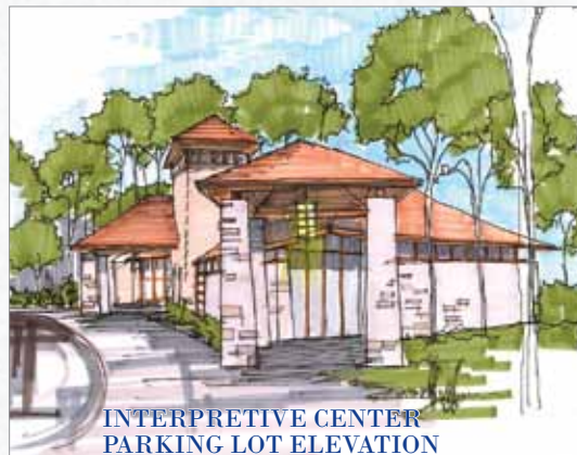
INTERPRETIVE CENTER PARKING LOT ELEVATION