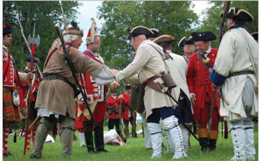
Founder’s Day Weekend Reenactment Activities

– Judges’ remarks, Ogdensburg’s All America City Application