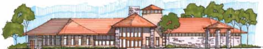
INTERPRETIVE CENTER ENTRANCE ELEVATION

CONCEPT DRAWINGS BY FOIT-ALBERT ASSOCIATES